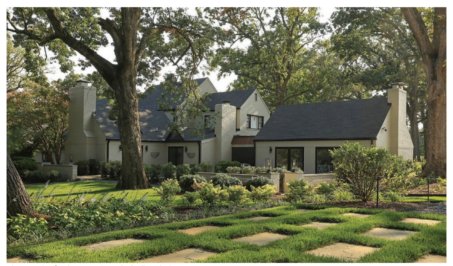
The new Indoor/outdoor Event Center for family gatherings.

On the horizon for 2024 is converting a barn to a conservatory, a unique space for events that will feature trees and French sculpture. ■